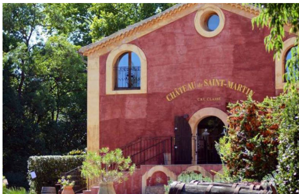
St. Tropez, France

Uncover beautiful vineyards and enjoy a special tasting of "Cru Classé," grown on the land of the same aristocratic family since 1740.