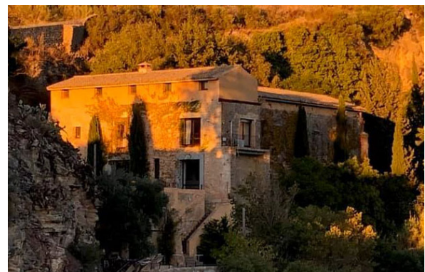
Puerto Banus, Marbella, Spain

Explore Ronda, one of Spain's oldest cities, by foot, then taste the region's exquisite wines in a unique cellar nestled in the chapel of a sixteenth-century Trinitarian monastery.